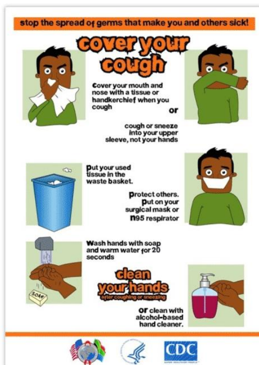
Infection control posters developed by CDC - South Africa (Global AIDS Program)