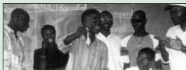
Association de Jeune de Liberté 4 integrating HIV/AIDS and the social marketing of condoms into their environmental work with young people in Dakar, Senegal.