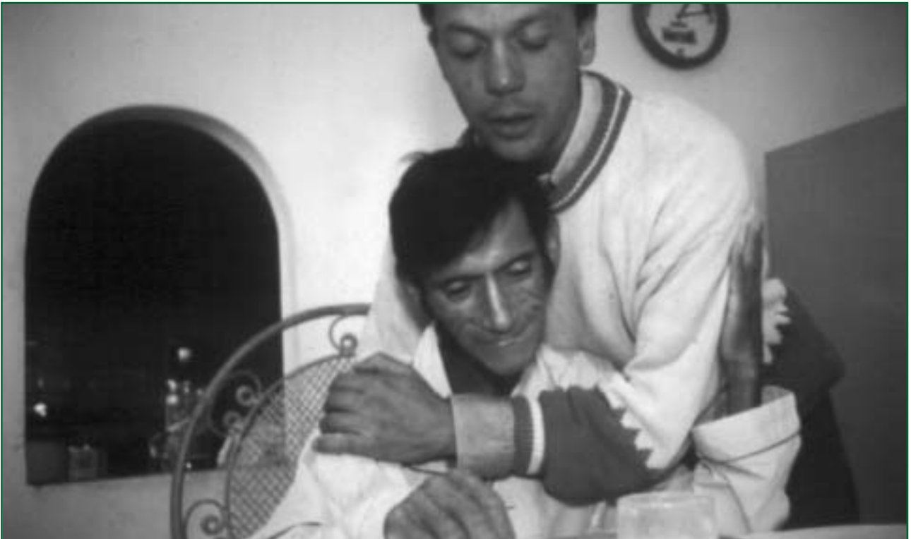
EUDES providing support for people living with HIV and AIDS in a community hospice in Quito, Ecuador.

In this context, the Alliance recognises the importance of creating safe spaces and supportive environments for people living with HIV and AIDS. In the Philippines, PHANSuP, the Alliance linking organisation, has supported Pinoy Plus, based in Metro Manila, to become the first Filipino self-help group for people living with HIV and AIDS, offering counselling, recreation facilities and income generation.