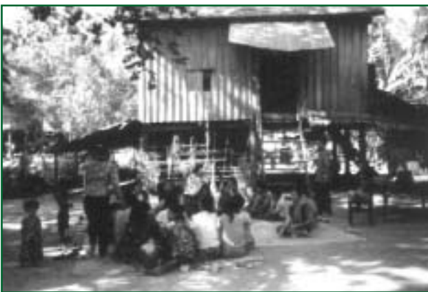
By working with community groups in Cambodia, KHANA has doubled the local NGO response to HIV/AIDS.

Many partner NGOs have used peer education strategies, in which community members are trained to serve as HIV/AIDS educators for their community. PHANSuP, in the Philippines, has supported a number of NGOs using volunteers and peers from target communities, including Baguio Centre for Young Adults