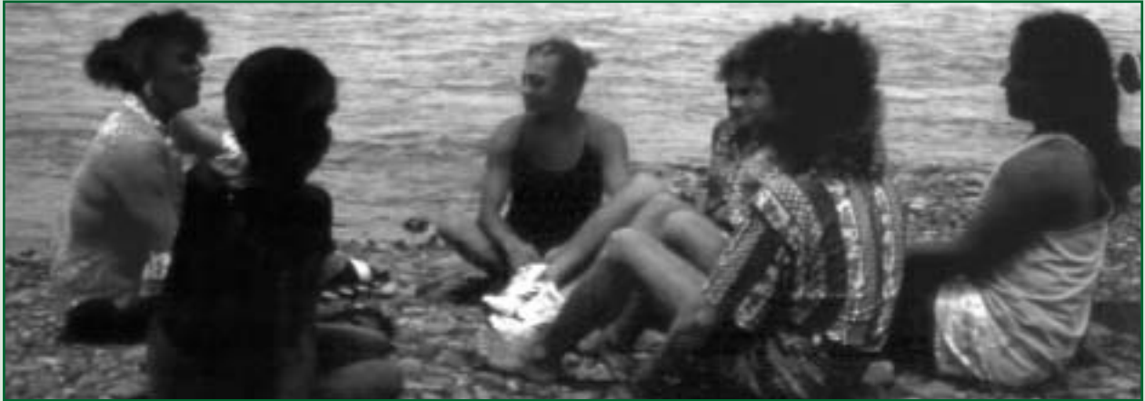
FAES meeting on the riverbank - one of the few places where the transvestite members can avoid stigmatisation in Quevedo, Ecuador.

Fundación Ayuda y Educación en SIDA (FAES) was established six years ago in Quevedo – a small town where “everyone knows everyone”. They started as a response to three members finding out that they were HIV positive. The members are transvestites – mostly from poor, rural backgrounds with little education. Many are involved in sex work, alcohol and drug use, and have been the victims of violence. Many have run away from home and live in small groups that work together in cabarets or street corners. Their living conditions are appalling. FAES wanted to respond to specific situations experienced by transvestites, including: