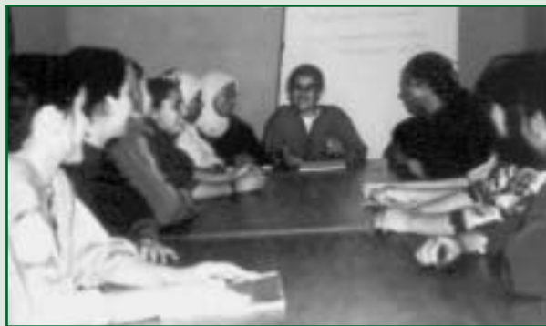
Association Oued Srou combining sexual health and sexuality discussions with economic activities with young women in Khenifra, Morocco.

In Morocco, PASA/SIDA has supported Association Oued Srou in the use of group discussions within socio-economic activities with poor young urban women in Khenifra.