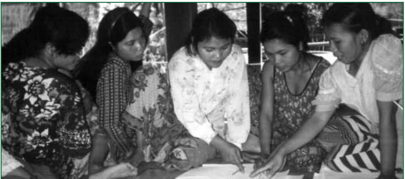
Participatory methodologies being used to help community members to “move beyond awareness” in Cambodia.

The “Community Lessons, Global Learning” programme – and, therefore, this report – draws lessons from the Alliance’s experience in supporting HIV/AIDS prevention and care strategies which not only build on but also move beyond the provision of information and the raising of awareness. It is based on the work of the Alliance’s linking organisations and their partner NGOs in developing countries in Africa, Asia and Latin America. For the sake of brevity, this “family” (comprising the international secretariat, linking organisations and partner NGOs) will be collectively referred to as “the Alliance”.