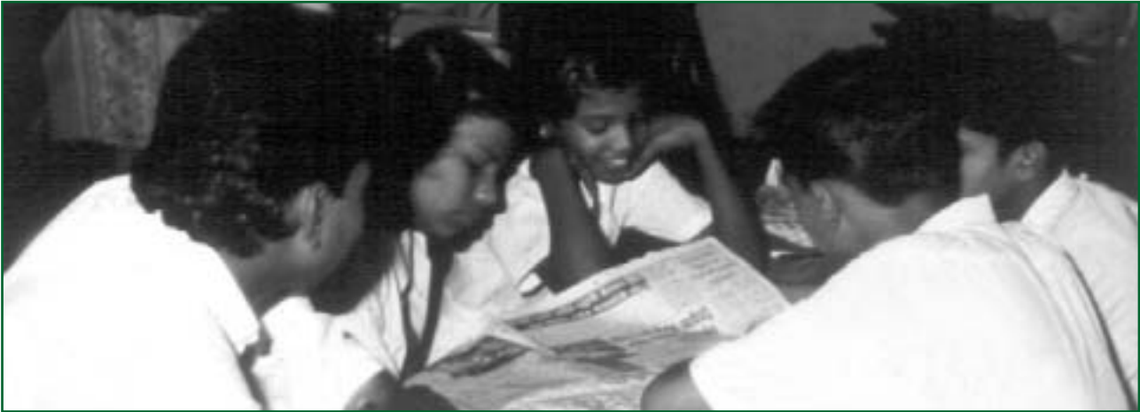
School peer educators leading discussions about sexual health and self esteem with the support of SOWEL, Sri Lanka.

and scoring, seasonality charts and personal lifelines. As noted earlier, these approaches helped NGOs respond to real needs of community members, and develop strategies to address important contextual issues. Having benefited from these methodologies, a number of NGOs used the opportunity of the country seminars to explain how they are trying to respond to an increasing understanding of vulnerability and context – and to emphasise how they have successfully reassessed their own behaviour and attitudes as facilitators of social change.