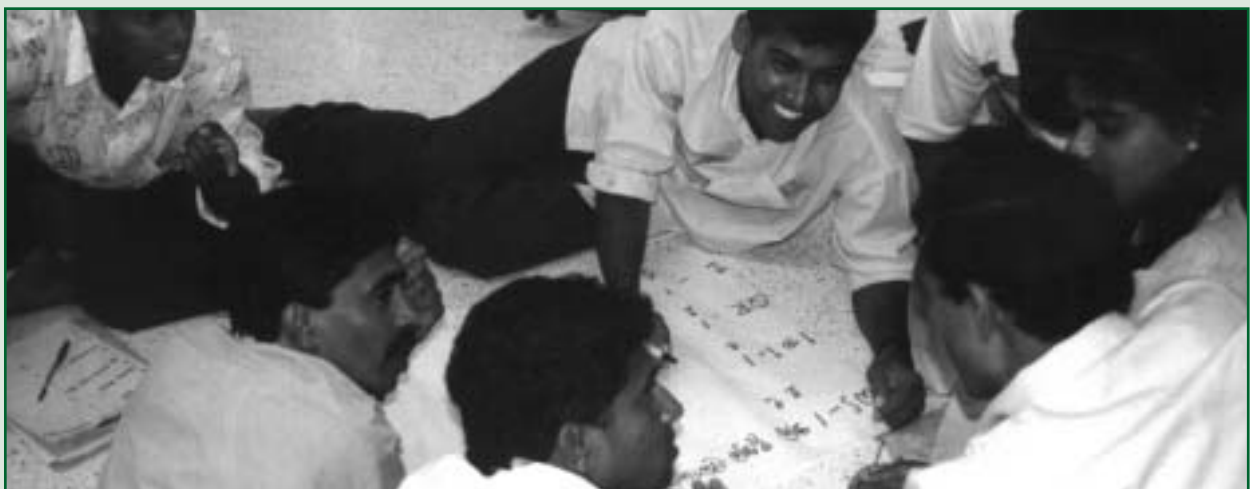
NGO participants at the Alliance Lanka country seminar, Sri Lanka, exchanging lessons in participatory prevention work.