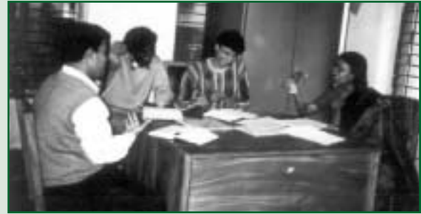
Members of ACD receiving technical support from the Alliance linking organisation HASAB, Bangladesh.

At the country seminar in Bangladesh, the Association for Community Development (ACD) shared their experiences in working with young women being trafficked or migrating across the Bangladeshi/India border. Staff members described the nature of the women's vulnerabilities to HIV infection: