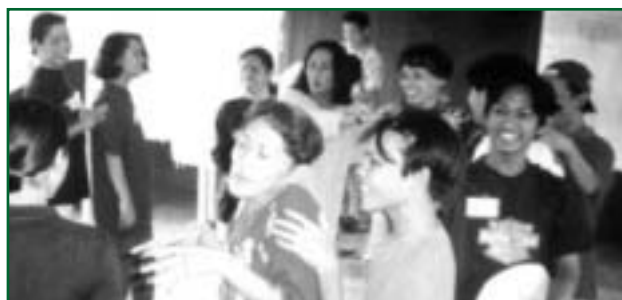
Members of IWAG using participatory methodologies to build self-confidence among gay men in Davao City, the Philippines

At almost every country seminar over the first year of the "Community Lessons, Global Learning" initiative, NGO participants shared how they had successfully used techniques and approaches from community development work to strengthen their responses to HIV/AIDS. Such work encourages an analysis of structures as well as behaviours, and of communities as well as individuals. In turn, this analysis suggests that responses to the epidemic must address not only community problems, but also problems "of community" – including the norms and values that shape relations between people which, in turn, create exposure and vulnerability to HIV.