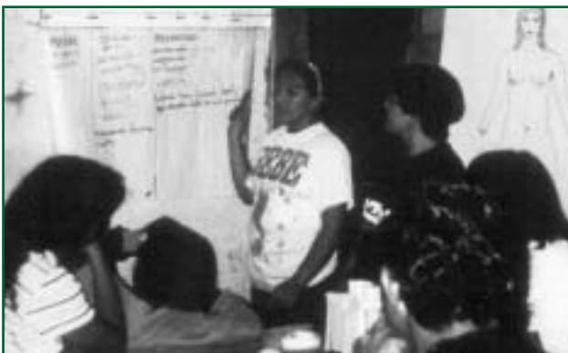
Despertando raising issues of power relations between men and women during family workshops in El Guasmo, Guayaquil, Ecuador.

The importance of a gender-sensitive assessment practice was stressed during all the country seminars, with groups sharing their success at encouraging single sex discussion groups and same sex facilitators. Some NGOs reported how increasing gender awareness led to changes in staffing. For example, ACD hired two female staff members to work with the young women being trafficked across the Bangladeshi-Indian border. Despertando,