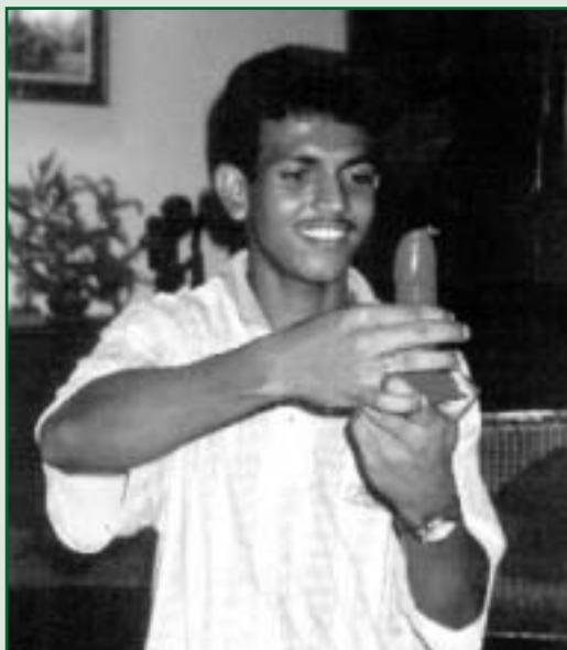
With Saviya, Sri Lanka, beach boys learn not only how to fit condoms, but also how to negotiate their use.

“We don’t just need to learn the facts about AIDS, but also how we can protect ourselves. We don’t want to stop having sex, but we do want to learn how to do it safely. We need to be able to discuss these things – because in our culture we don’t talk about sex. Here, we can talk openly about what’s on our mind, get condoms and learn about ways to take care of ourselves.”