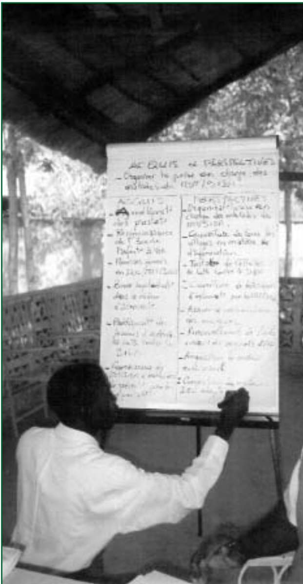
A brainstorming session on care and support as part of the IPC country seminar, Burkina Faso.

The first year of the “Community Lessons, Global Learning” collaboration between the Alliance and Positive Action has enabled a rich sharing of practical experiences among communities, countries and continents. In addition to improving the quality of individual efforts in HIV/AIDS prevention and care, the initiative has highlighted vital lessons, questions and recommendations of relevance to key stakeholders involved in the global response to HIV/AIDS.