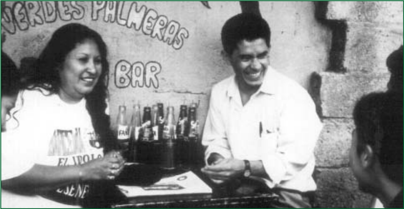
Comité por Derechos Humanos discussing strategies to address the needs and vulnerability of sex workers in Santo Domingo de los Colorados, Ecuador.