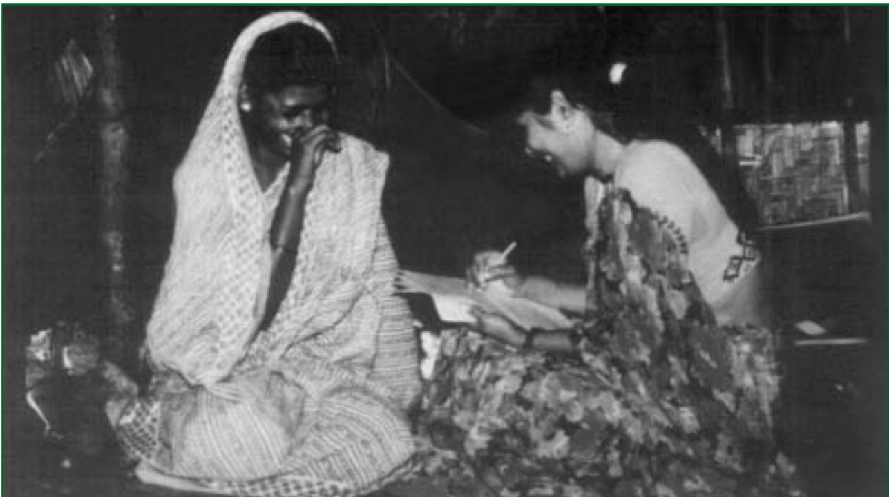
Participation and involvement have been central to helping rickshaw pullers and their wives to "move beyond awareness" with the support of CRSD, in Dhaka, Bangladesh.