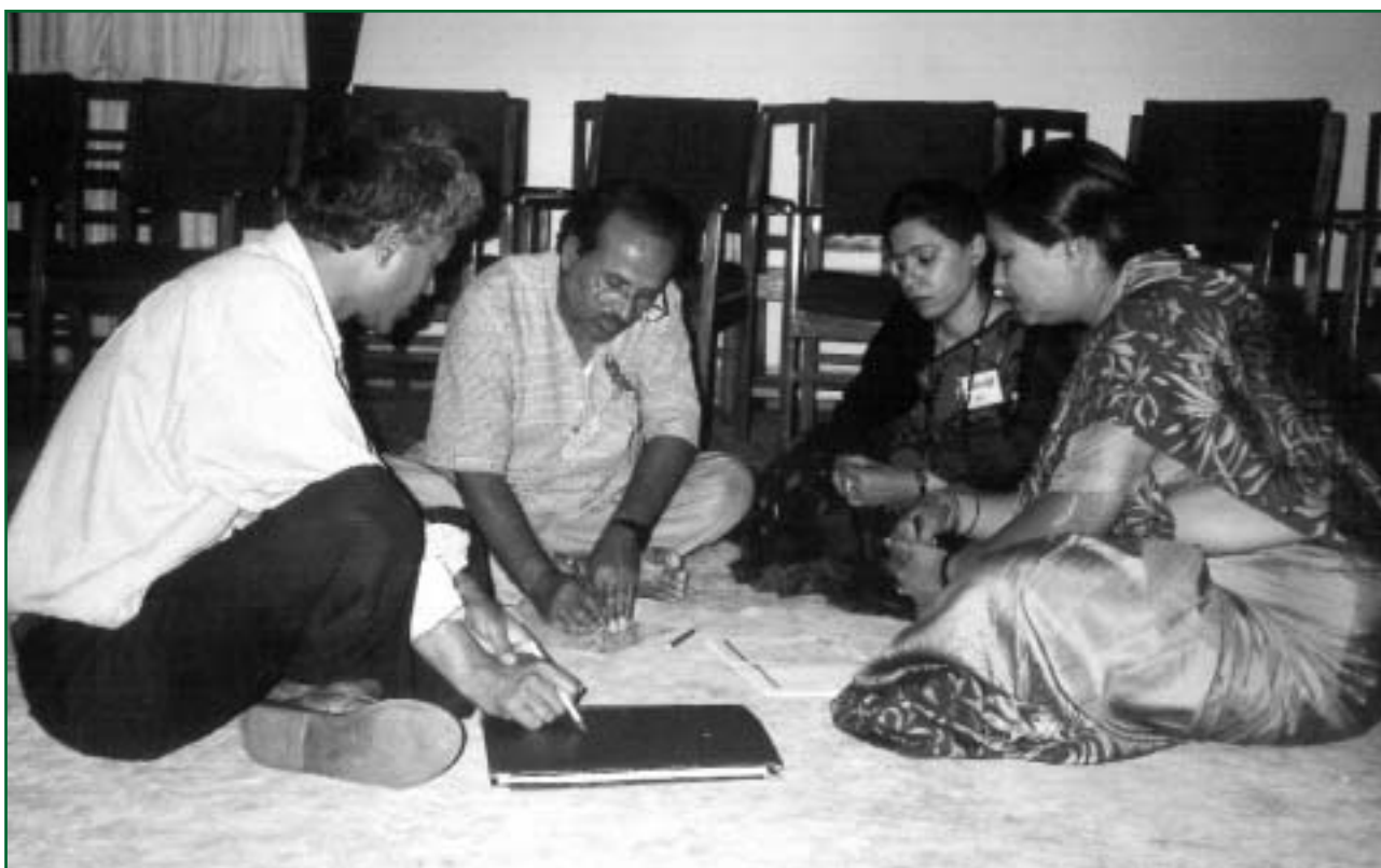
A small group discussion on experiences in gender and sexuality at the HASAB country seminar, Bangladesh.