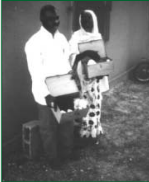
Members of L'AMMIE with their medical kits containing basic supplies, Ouahigouya, Burkina Faso.

Association pour l'Appui Moral, Matériel et Intellectuel à l'Enfant (AMMIE) was founded five years ago when health workers at the regional hospital in Ouahigouya, in the northwest part of Burkina Faso, grew frustrated with the growing number of preventable illnesses and emergency health visits among the local community.