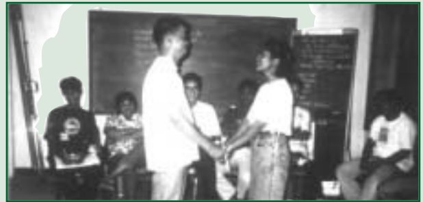
OCAFI linking prevention and care at a community level in Olongapo City, the Philippines.

In the Philippines, PHANSuP has supported OCAFI in combining counselling and self-help services with integrating people living with HIV/AIDS into community prevention work in Olongapo City.