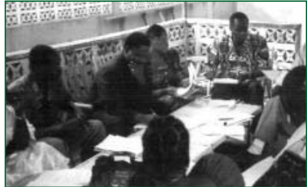
Participants at the IPC country seminar, Burkina Faso, sharing their experiences in community care and support.

A key element of the “Community Lessons, Global Learning” initiative is the organisation of annual country seminars in six of the countries where the Alliance and partner linking organisations have established comprehensive NGO support programmes. These are Bangladesh, Burkina Faso, Cambodia, Ecuador, Senegal and Sri Lanka.